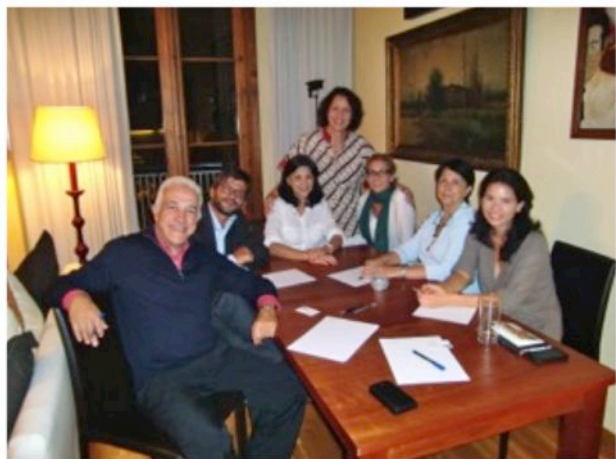
The above picture was taken in Barcelona, Spain where we had our very first meeting as a group.